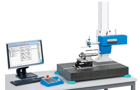
Hommel-Etamic T8000RC $44,990