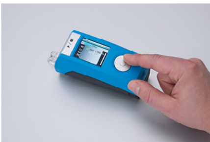
Hommel-Etamic W5 $1,949.00

Our handheld family of measurement systems help our customers perform surface finish quality control at the point of impact, right on the manufacturing floor. Backed up by our user friendly Hommel-Etamic EVOVIS Mobile evaluation software, your quality control won't be able to thank you fast enough.