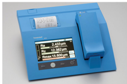
Hommel-Etamic W10 $3,900.00