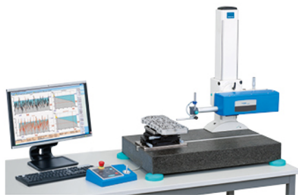
Hommel-Etamic T8000R $29,990

Our T8000 family of measurement systems consist of small compact table top systems, all the way up to fully automated shop floor production systems. With a complete line of robust accessories, our T8000's can be configured to measure not only roughness, but also simultaneous roughness and contour in one pass. Backed up by our user friendly Hommel-Etamic EVOVIS evaluation software, your quality control won't be able to thank you fast enough.