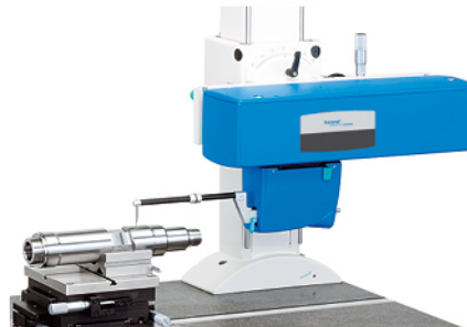
Hommel-Etamic T8000C $34,990