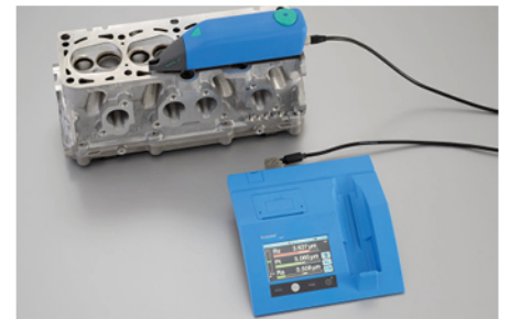
Hommel-Etamic W20 $6,900.00