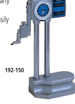
Easy and error-free reading